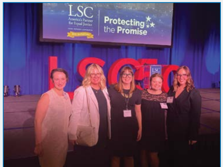
NLS staff and former clients gather at LSC Anniversary Celebration in Washington DC.