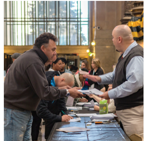
NLS' Employment Law Project has focused on helping people with criminal record barriers into employment.

cleared (rather than destroyed or sealed) from state or federal records. While many legal experts and advocates believe that expungement, in general, can help pave the way toward employment and better housing options, more research is needed to support this theory. This way legal advocates can create stronger plans for how to make expungement easily accessible to those who need it.